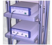
Nasal camera system with fiber optic illumination